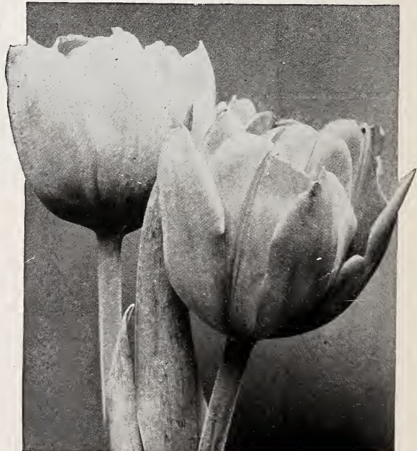
Double Early Tulip, Murillo.